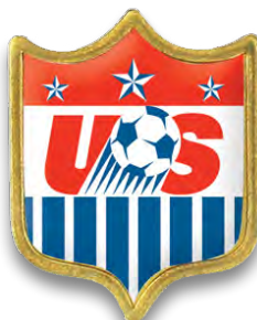
BL-4022 1 1/8"x 1"