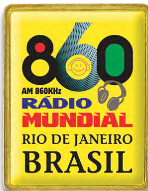
BL-4010 1 1/2"x1 1/8"