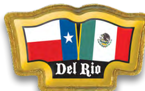
BL-4019 3/4"x1 1/4"