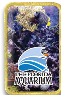
BL-4024 1 1/4"x 3/4"