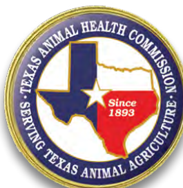
BL-4007 1 1/8"