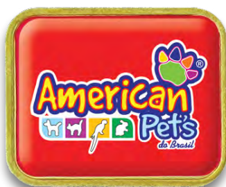
BL-4009 1"x1 3/8"