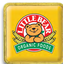
BL-4011 1 1/16"